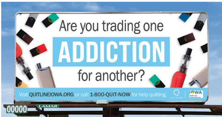
2nd Street, Davenport, IA