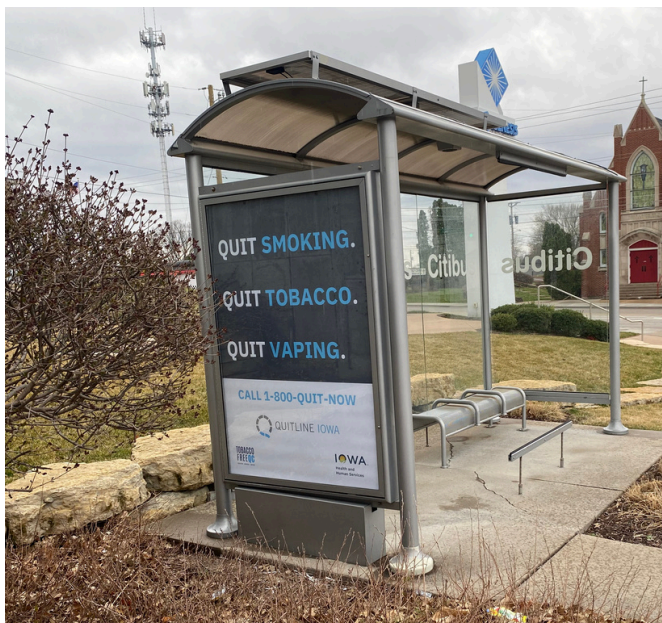
Eastern Ave., Davenport, IA