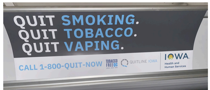
Buses around Scott County